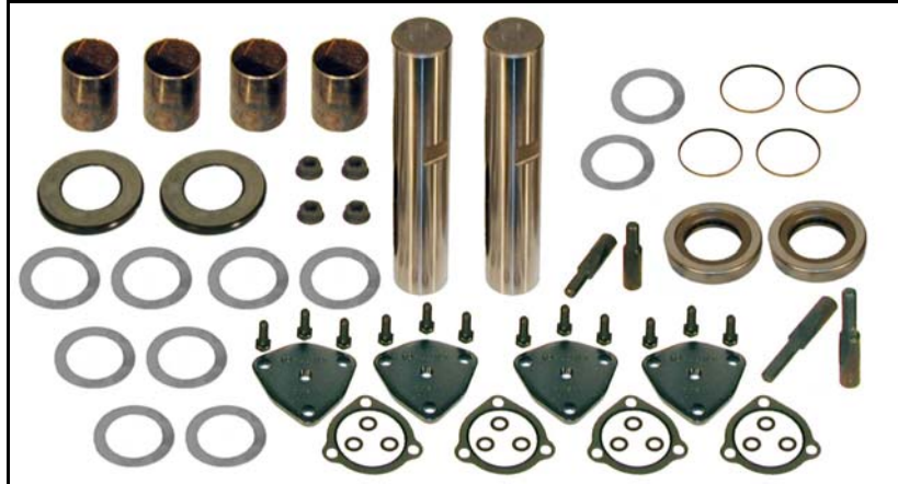
This is the G1012726 king pin kit ($129.11 U.S.). Mohawk offers a wide variety of standard and custom-made kits.

The benefits of Mohawk kits are obvious. It's much easier to order one kit instead of dozens